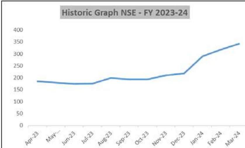
Historic Graph of Aries Agro on NSE

(ix) During the year under review the listed securities of the Company have not been suspended from trading by any of the Stock Exchanges.