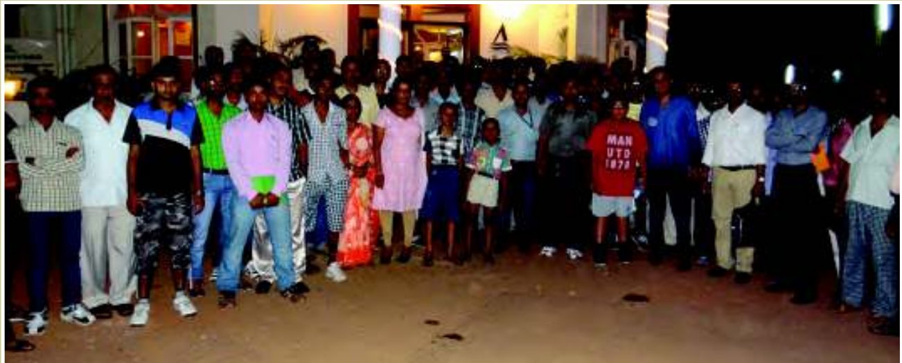
Flash Sale and Aries Customer Convention of Maharashtra Dealers at Hampi, Karnataka.