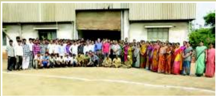
Aries Factory Staff and Workers at Hyderabad