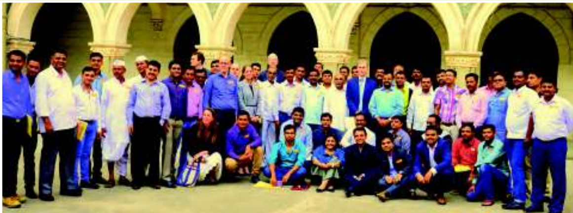
Aries session on optimizing post harvest supply chain for Indian Farmers in Association with Dutch Institute for Advanced Logistics, Holland Pioneers in International Market, Food & Biobased Research, Wageningen University & SCA Group, India