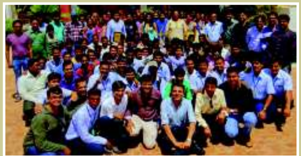
Aries Factory Staff and Workers at Chhatral, Gujarat