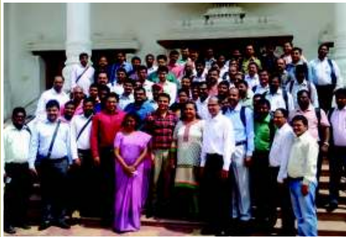
Inauguration of Executive Development Programme for Senior Managers at Kumaraguru College of Technology, Coimbatore