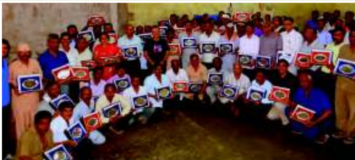
Felicitation of Aries Mumbai workers, who have served more than 25 years.