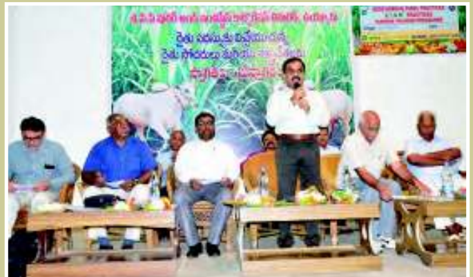
Workshop on Good Agri Practices in Balanced Crop Nutrition