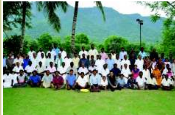
Tamil Nadu, Kerala and South Karnataka customers meet at Mettupalayam