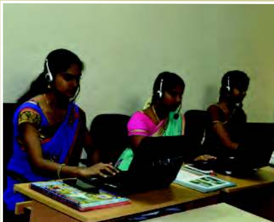
Aries Farmers Call Centre at Vijayawada