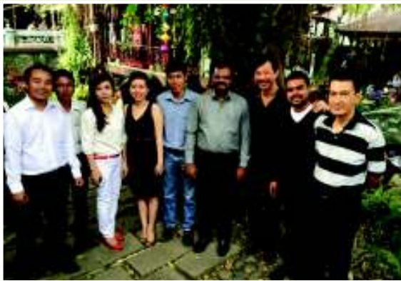
Vietnam Customers Visit