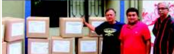
Aries led the first response providing extensive relief material in the aftermath of Kashmir floods.