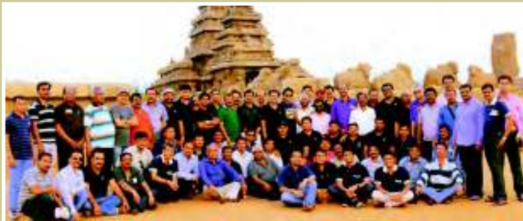
All India Strategy Meet, Chennai