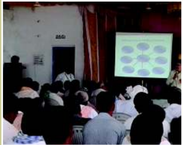
Farmers Meeting to share agriculture best practices