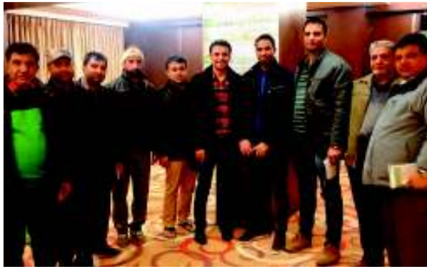
Flash Sale and Aries Customer Convention of Jammu & Kashmir Dealers at Srinagar