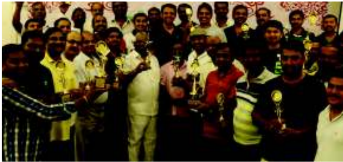
Award Winners of the Annual Chairman's Trophies for Marketing Teams