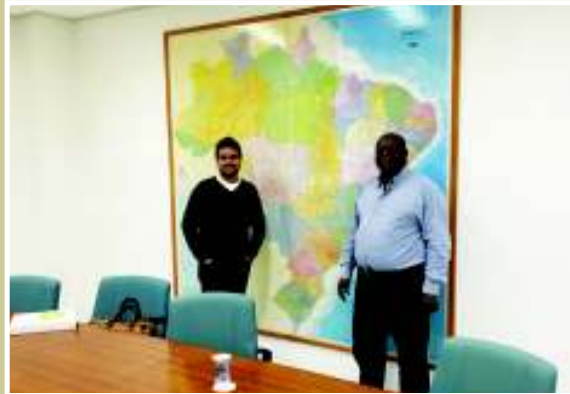
Brazil Client Visit