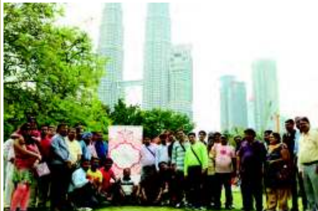
All India Chairmans Club Meet at Malaysia with Top 60 Aries Customers