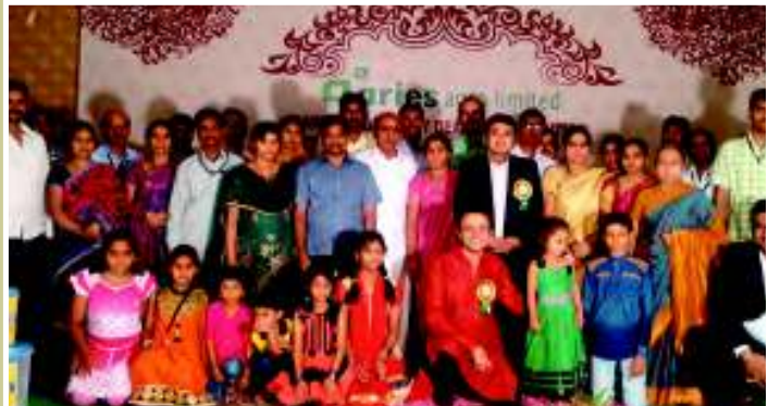
Get together with dealer's families and children.