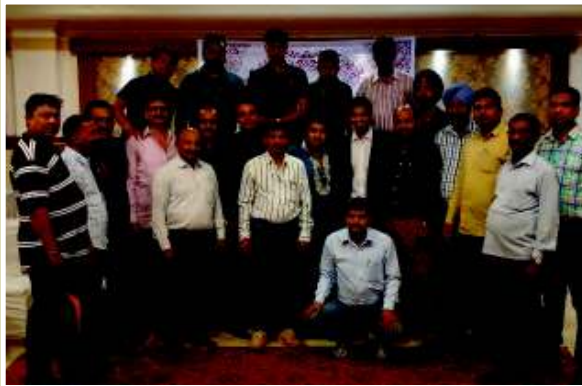
Flash sale and Aries Customer Convention of UP, Punjab, Bihar & Uttarakhand dealers at Shimla