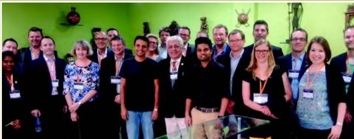
Students Group of FHNW, University of Applied Science, Switzerland at Aries Corporate HQ for their Annual study tour