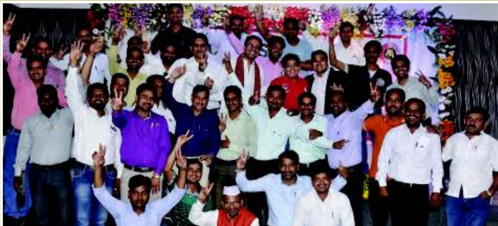
Top performers of the Aries Maharashtra team celebrating another successful year