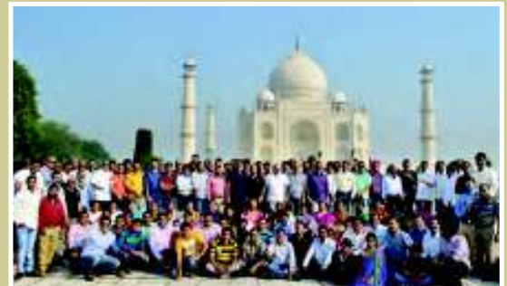
Half Yearly Review Meet, Agra