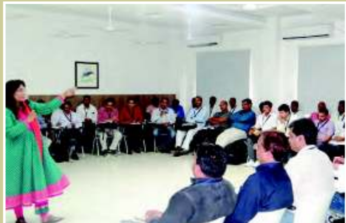
Soft skills development for Aries senior managers