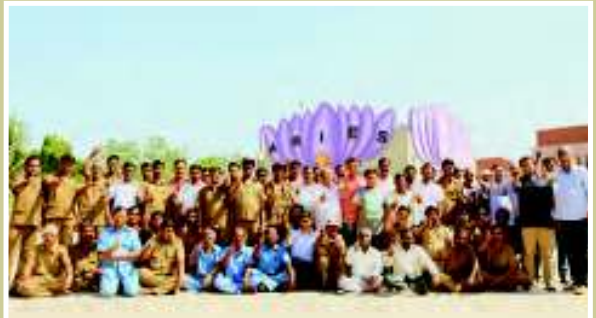
Aries Factory Staff and Workers at Mumbai