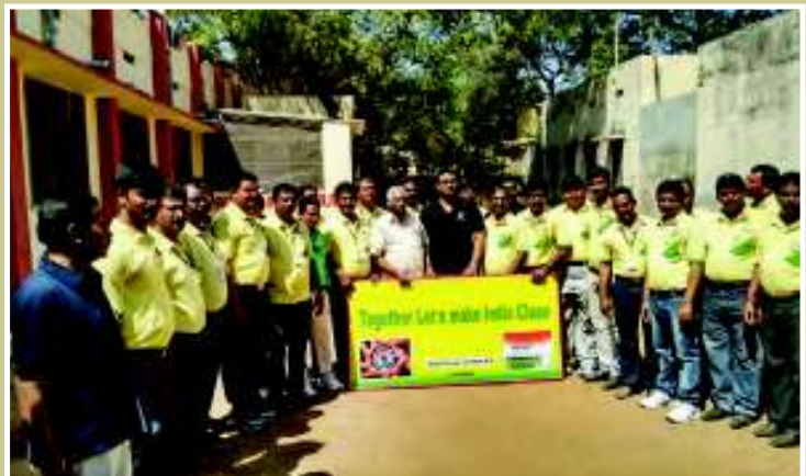
Swacha Bharat Abhiyan organized by Aries team in Guntur