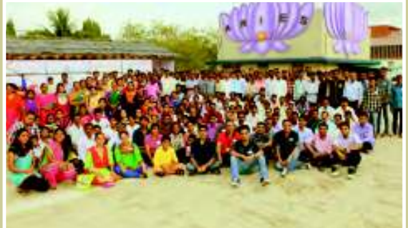
Family Day at Aries Corporate office, Mumbai