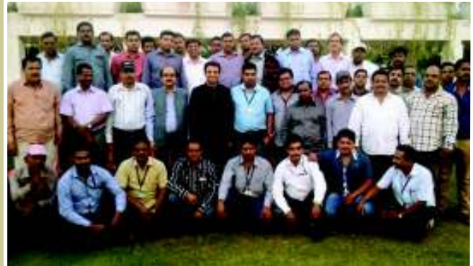
Flash Sale and Aries Customer Convention of Orissa and Jharkhand Dealers at Puri