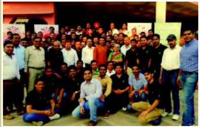
Flash Sale and Aries Customer Convention of Rajasthan, Haryana and Himachal Pradesh Dealers at Udaipur