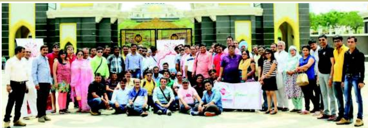
All India Chairmans's club meet in Kuala Lumpur, Malaysia