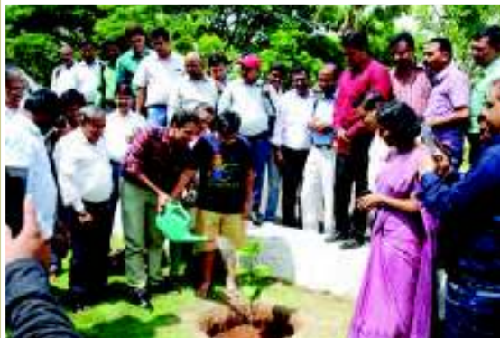
Tree plantation drive organized by Aries Agro.