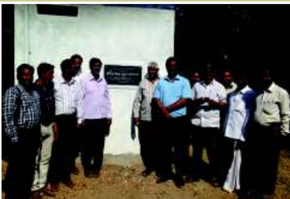
Construction of Girls Washroom at Timmarajupalem